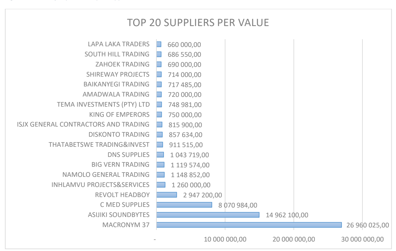
Figure 2: Value of expenditure per supplier